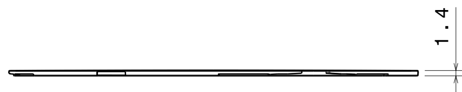
Front view Scale: 1:1